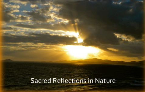
Sacred Reflections in Nature

The University of the Virgin Islands (UVI) established the Center for the Study of Spirituality and Professionalism (CSAP) as part of UVI's commitment to engendering an atmosphere in which people from various walks of life can practice tolerance and engage in the sharing of worldviews on spirituality and professionalism.