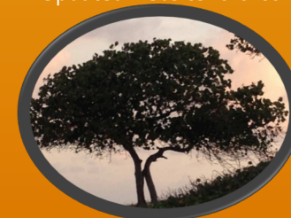
A Tree of Life in the VI

Updated website forthcoming: csap.uvi.edu