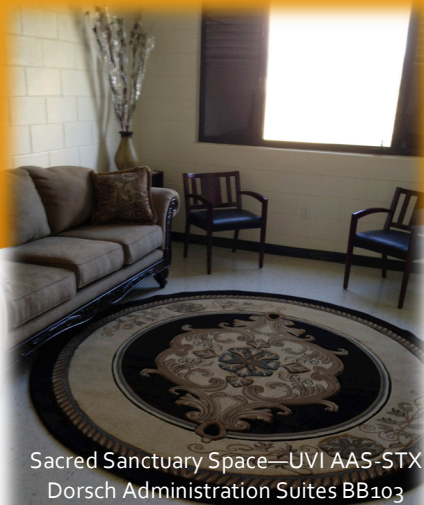
Sacred Sanctuary Space—UVI AAS-STX Dorsch Administration Suites BB103