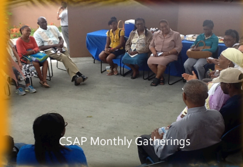
CSAP Monthly Gatherings