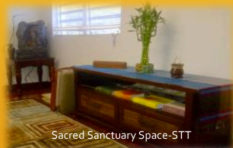
Sacred Sanctuary Space-STT